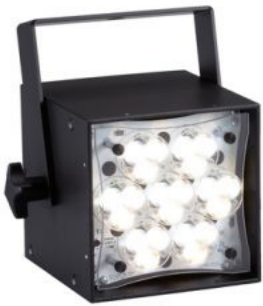
Braq Cube® WNC Designed by The Black Tank

Thank you to 4Wall Entertainment for sharing their story with us and for including our Braq Cube WNC fixtures in their design for this worthwhile event. Visit the Pan-Mass Challenge website to see how you can support their efforts: www.pmc.org