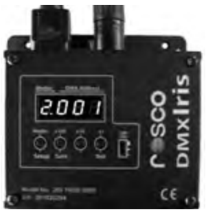
Figure 2 Digital Display pad

If no DMX signal is present, the digital display will indicate "LOST" and "512" in alternating sequence. If a DMX signal is present, the display will indicate both the operation Mode and the current DMX address of the Iris. (Figure 2) In this example, the DMX Iris is set to Mode 2 and DMX Address 001.